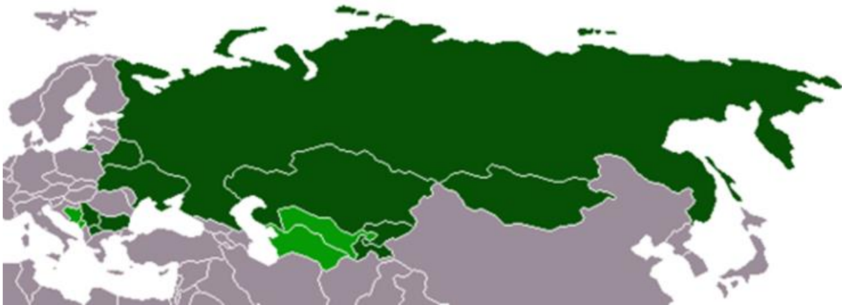
Figure 1: Geographic territories spread of Cyrillic